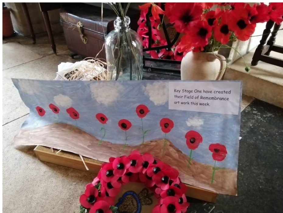
Beautiful poppy artwork by the Acorns class, on display in the Church