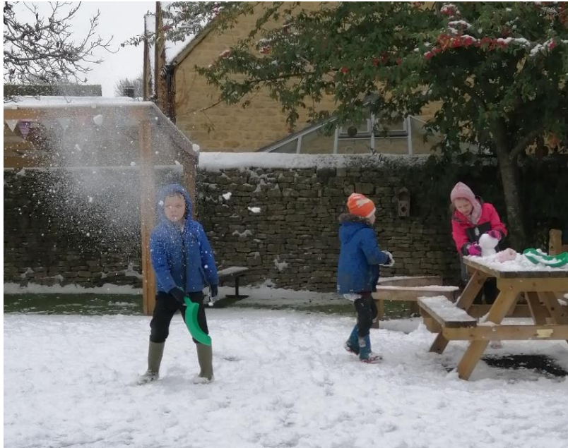
The playground was transformed....