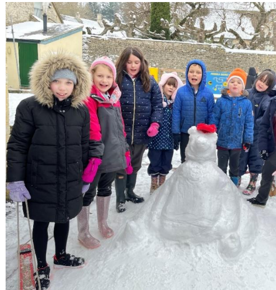
Building Bibury Snow Bear!