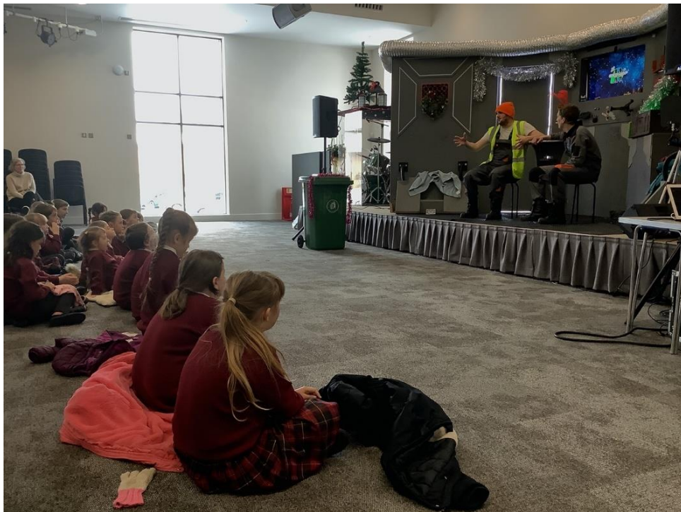
"The Last Satellite before Christmas" at Cirencester Baptist Church

Our Christmas events have included no less than two live shows: the first was the entertaining version of 'The True Adventures of Marian and Robin Hood' at the Barn Theatre, where we really enjoyed the way that the cast picked up and played instruments to accompany their own songs; the second was 'The Last Satellite before Christmas', a production by Forefront Theatre at the Baptist Church in Cirencester, which, as well as being very funny and interactive, reminded the children of the true meaning of Christmas. On Monday 12 th December, we took part in a carol service at the church, which included games and a visit from Father Christmas! Tuesday evening brought our Christmas concert - a wonderful evening of festive song alongside children from North Cerney School. Many thanks to the members of the church community for providing refreshments for both of these events. Our final flourish was our Christmas lunch and party held on Wednesday, which the children all thoroughly enjoyed.